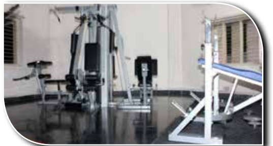
Mini Gym for Physical Fitness