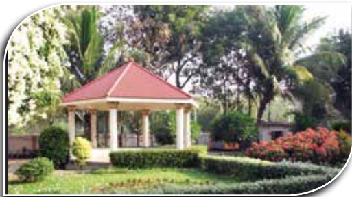
Enchanting Kiosks for Group Discussions