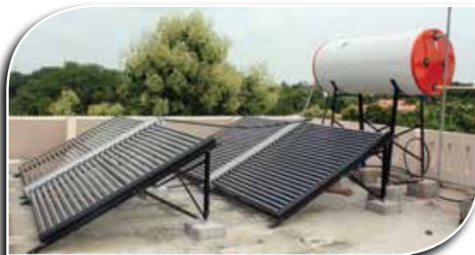
24 hour Hot Water